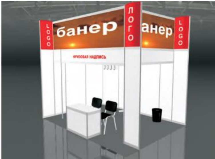
Shell Scheme “OPTIMA” 12 sq.m. with standard equipment