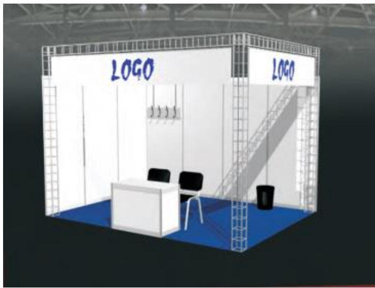
Shell Scheme "LUXE" 12 sq.m. with standard equipment