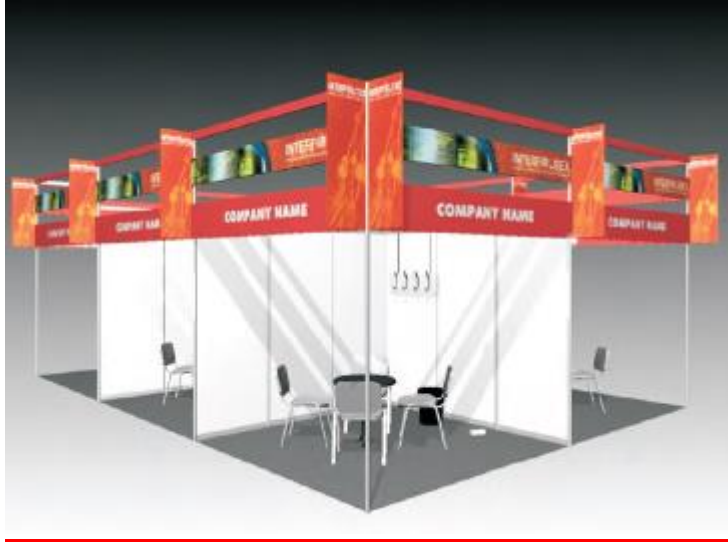
Shell Scheme «ALPHA» 12 sq.m. with standard equipment