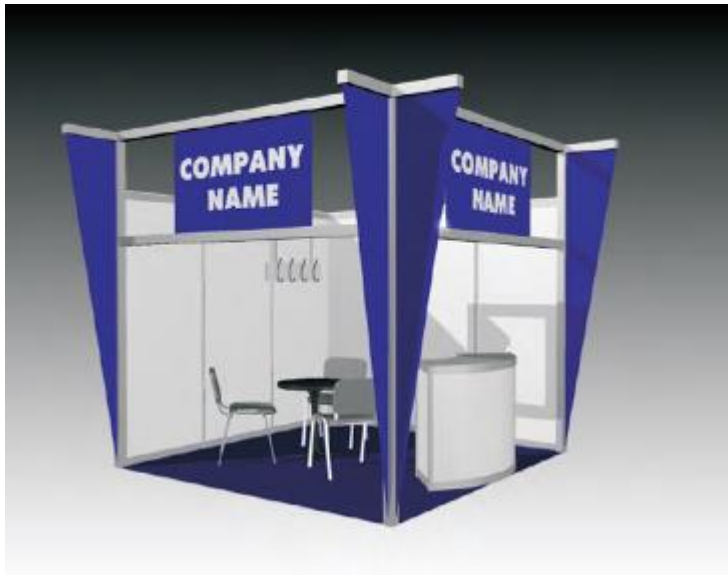
Shell Scheme «BETA» 12 sq.m. with standard equipment