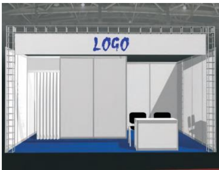
Shell Scheme "LUXE" 20 sq.m with standard equipment